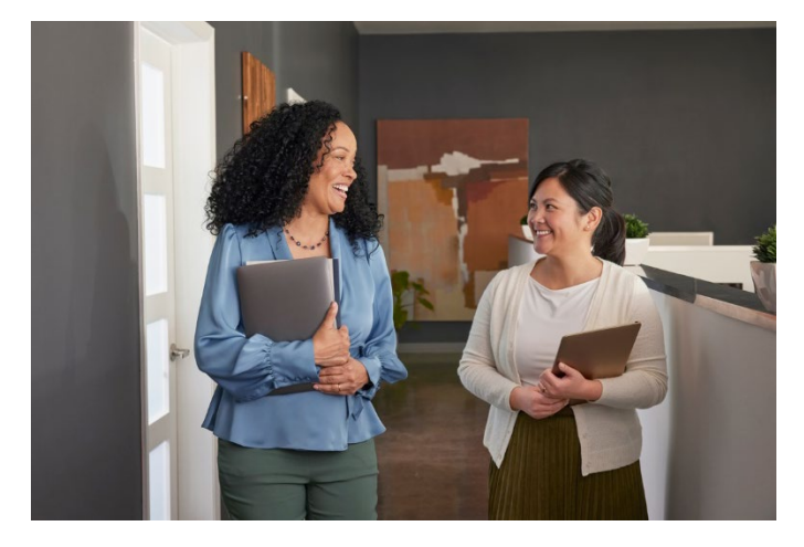
Element VI: Effective System for Routine Monitoring, Auditing, and Identification of Compliance Risks

Disciplinary standards must be communicated on an ongoing basis, not simply during an initial or annual training or in policies that not all may receive. Example communication methods include: newsletters, regular presentations and as an agenda item in staff meetings, communications with downstream entities, general compliance training, as well as prominently displaying the information on an intranet site and posters throughout work and break areas.